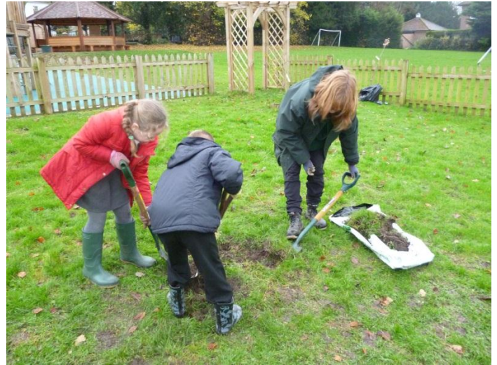
. . . Planting Fruit Trees with Year 2