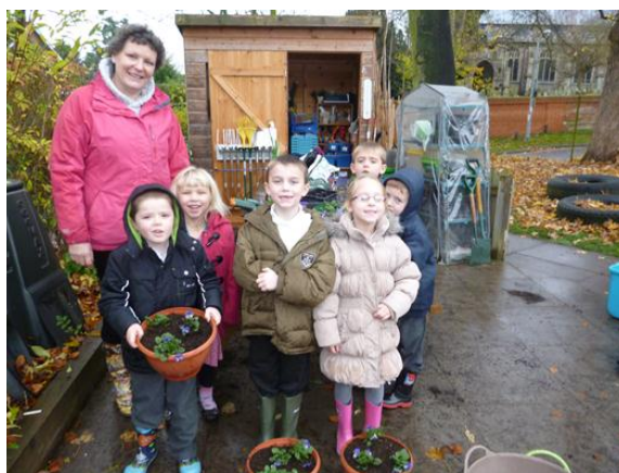
Planting Up Hanging Baskets with Year 1