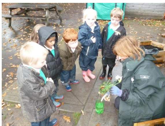
Planting Bulbs with Reception