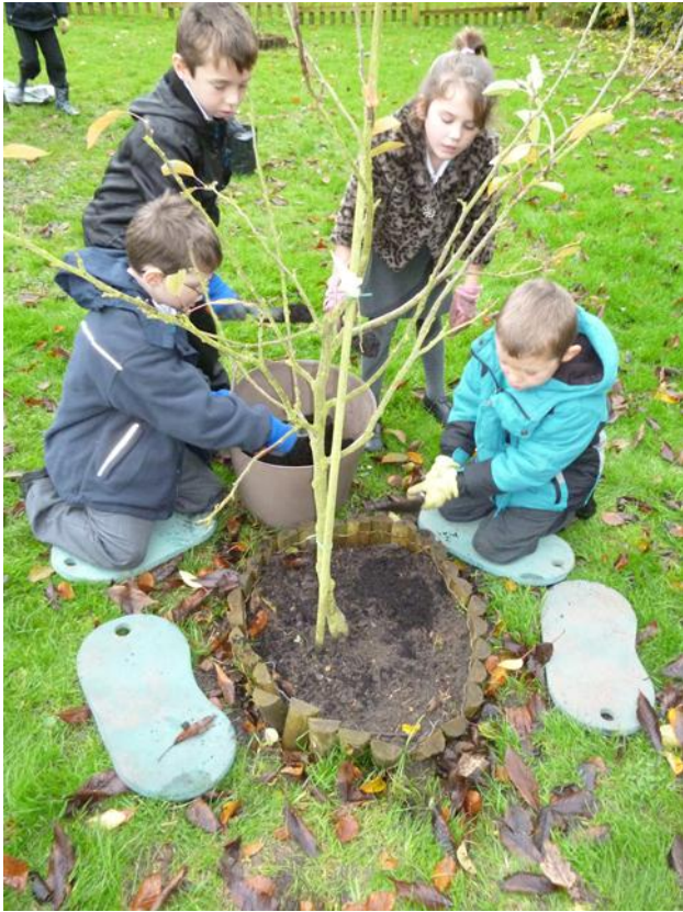
Mulching and . . .