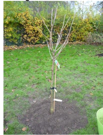
Our new Cherry Tree